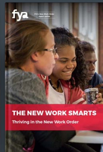
The New Work Smarts, July, 2017