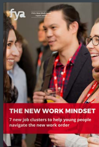
The New Work Mindset, November, 2016