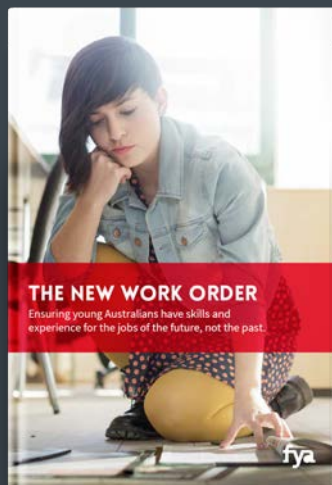
The New Work Order, August, 2015

For more information and to access all of the reports in the New Work Order report series see: fya.org.au/our-research