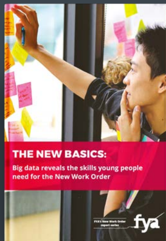
The New Basics, November, 2015