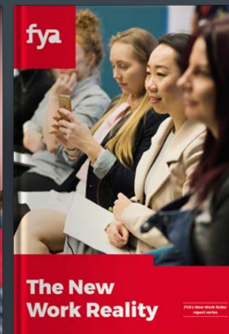
The New Work Reality, June, 2018