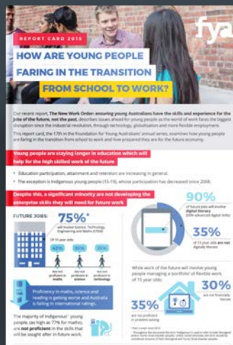
How Young People Are Faring, April, 2016